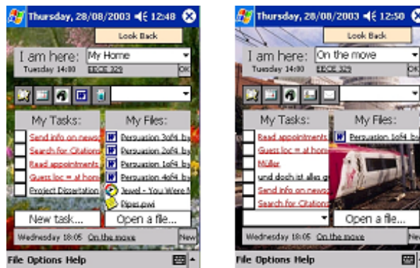
Fig. 2. Screens for a user at two locations

tions of use. The responsibility remains with the student of ensuring that they have the particular documents that they will require. Although students tend to use different files in different locations, from the logbook data it was often more difficult to predict where they might be at any one time except for during their scheduled lecture and lab sessions. Consequently, the problem of pre-fetching anticipated useful information or documents before students leave a connected area is not considered. The interface of My Chameleon is illustrated in Fig. 2.